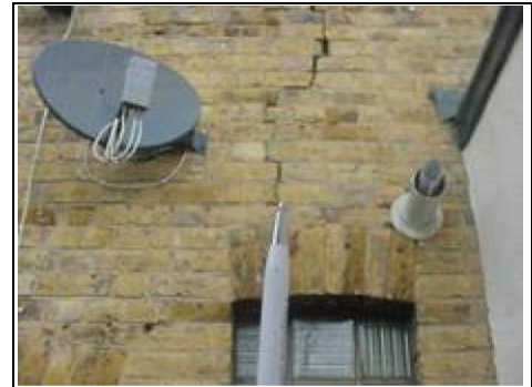
Crack in brickwork

Some other professions may have skills in these areas, such as architects, who are in the RIBA (Royal Institute of British Architects), or builders, who are in the CIOB (Chartered Institute of Building). You do really need to check that whatever the profession that they have an expert in your type of building and in the problem you have.