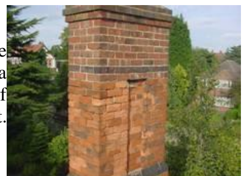
Crack in brickwork

What is often forgotten about when you have properties with cracks in (and you really don't want a property with a crack in) is the amazing amount of dust and dirt when repair work is being carried out.